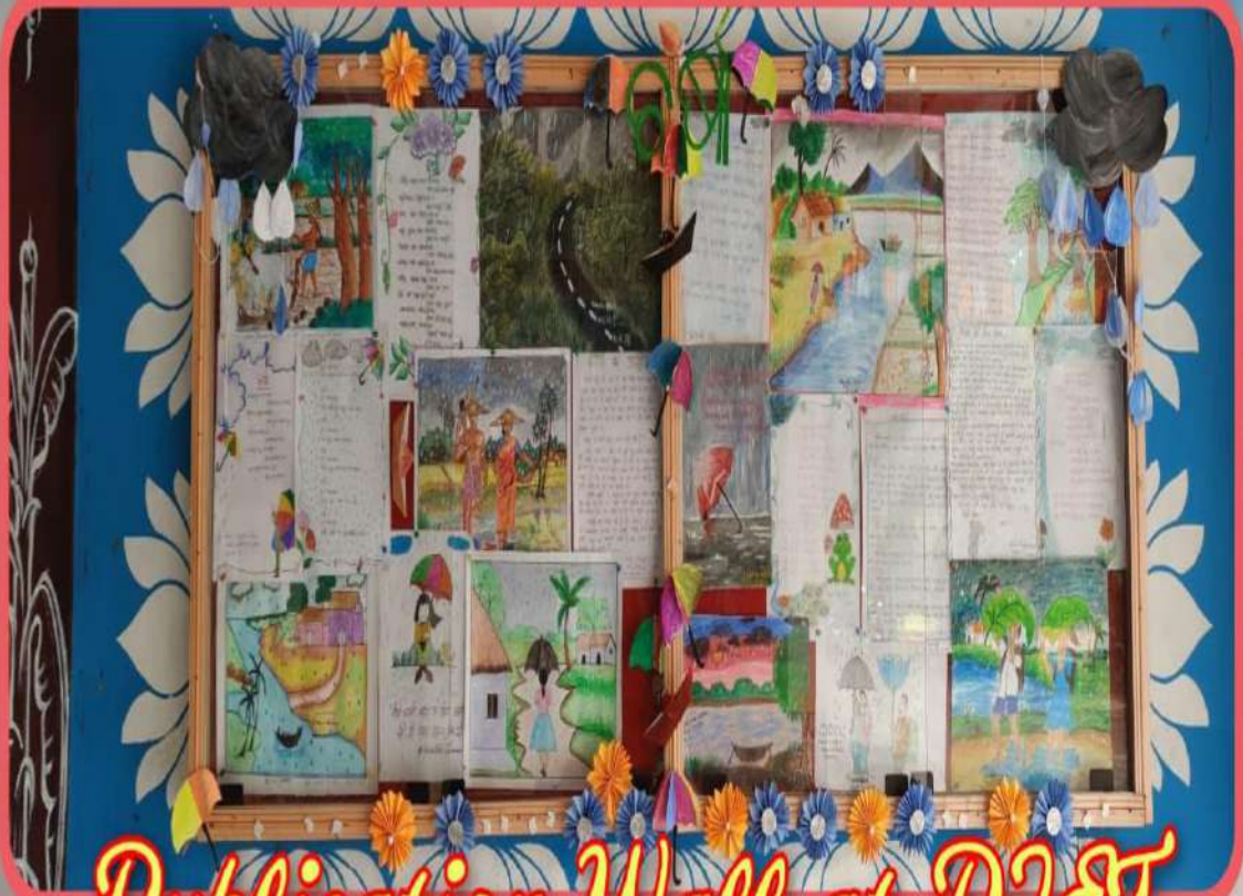
Publication Wall at DIET