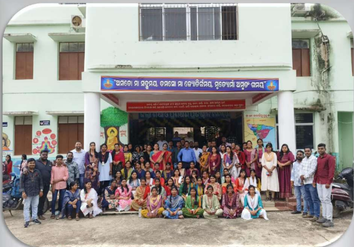
2 nd Year Batch – 2023-25