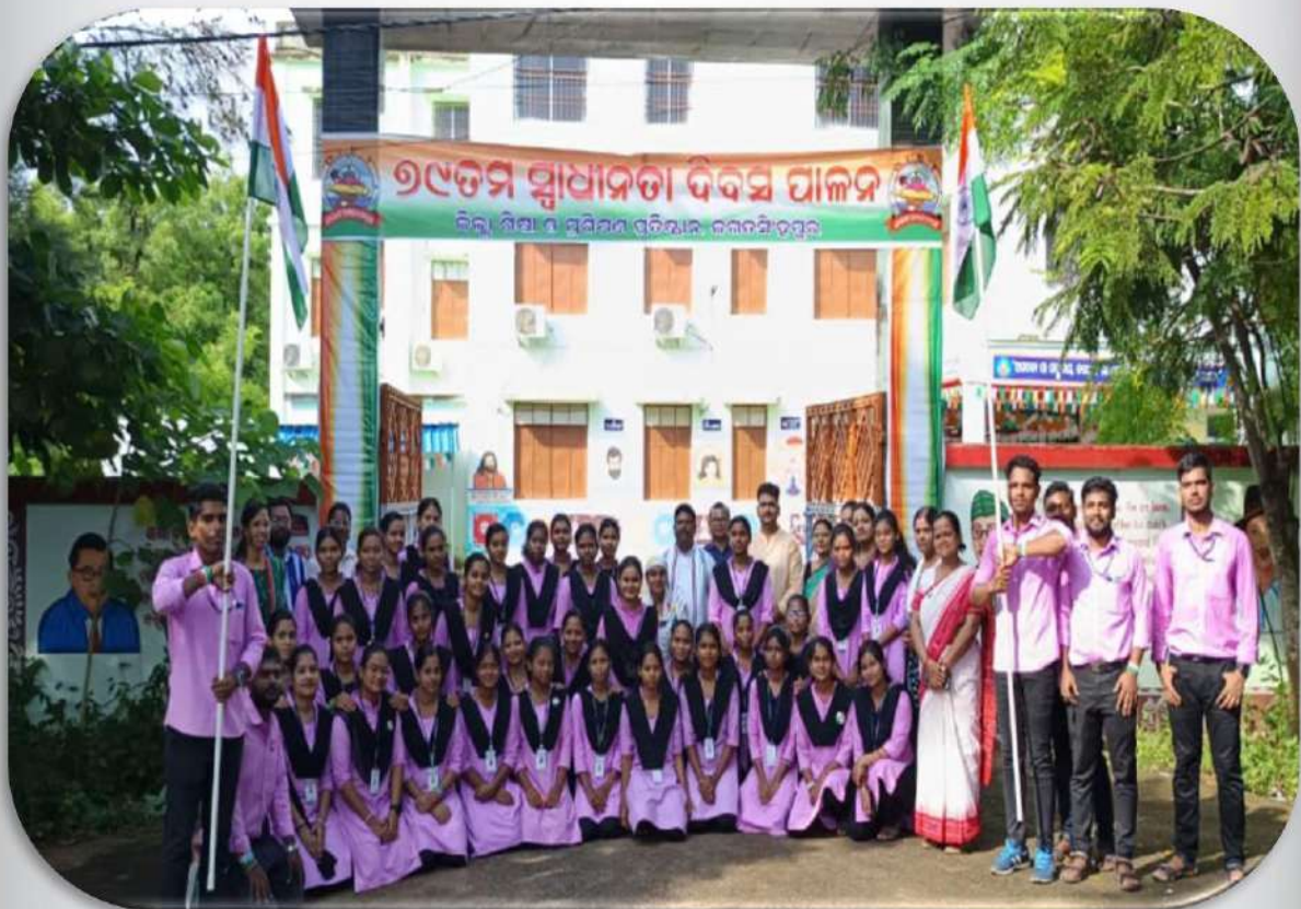
1 st Year Batch – 2024-26