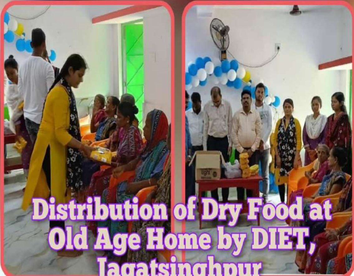
Distribution of Dry Food at Old Age Home by DIET, Jagatsinghpur