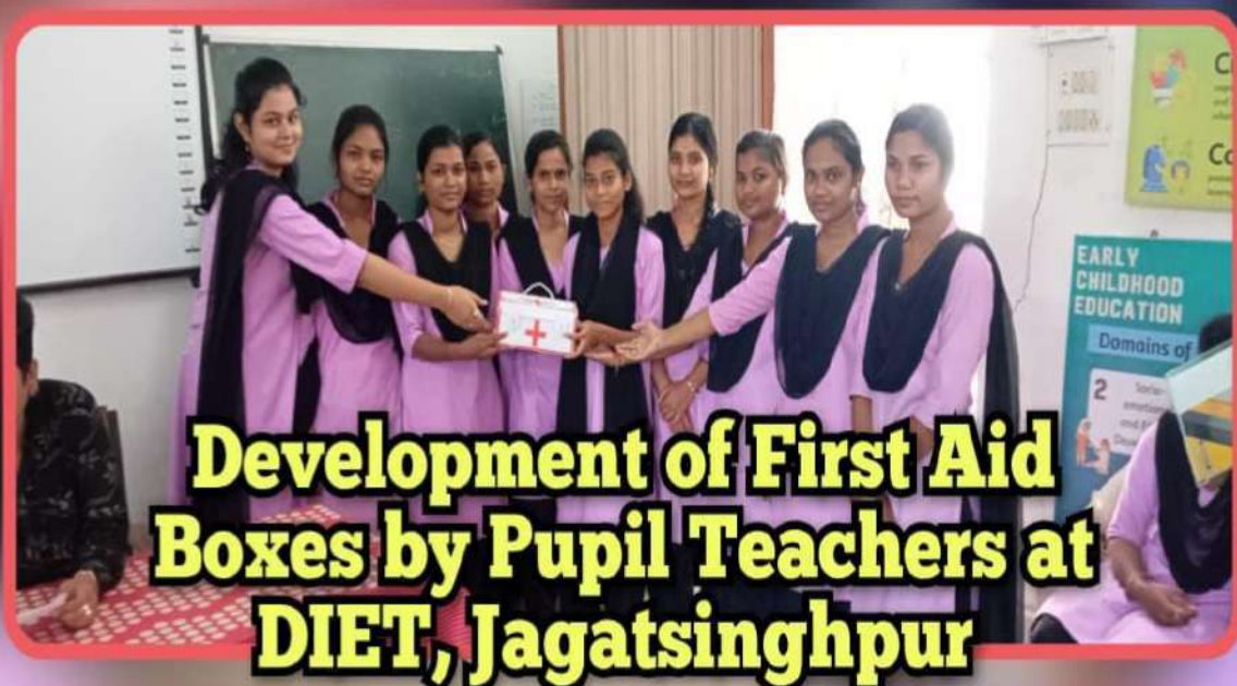
Development of First Aid Boxes by Pupil Teachers at DIET, Jagatsinghpur